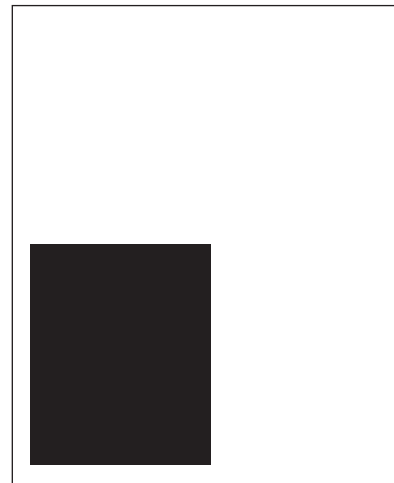
Quarter-Page 3.75" x 4.75" (live area)

Note: Artwork must camera ready. Electronic Disk preferred, but ad may be supplied on film as well.